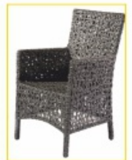
MPOC - 22