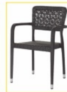
MPOC - 19