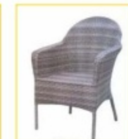
D - 89