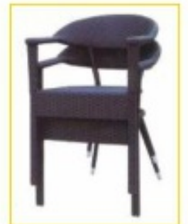
D - 91