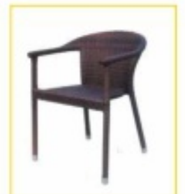
D - 92