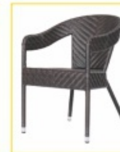
MPOC - 24