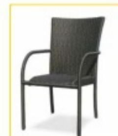
AC - 21