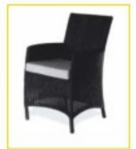
AC - 24