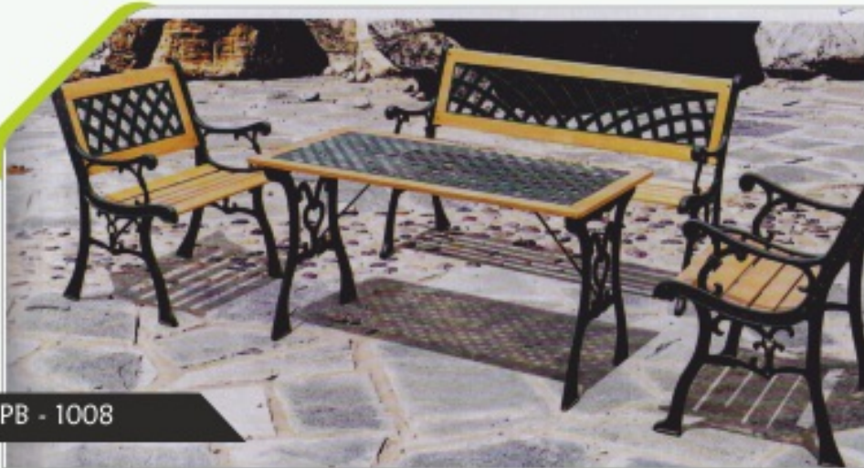
PB - 1008