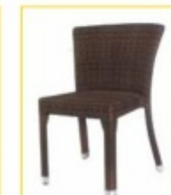
D - 44 A