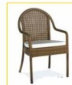
AC - 23