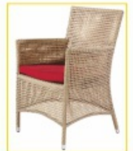
MPOC - 27