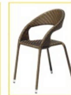
MPOC - 20