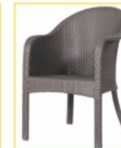
MPOC - 25