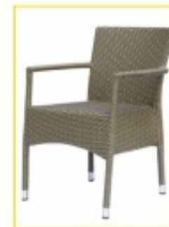
MPOC - 18