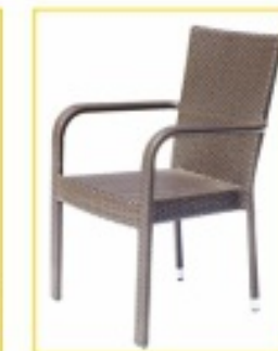
MPOC - 21