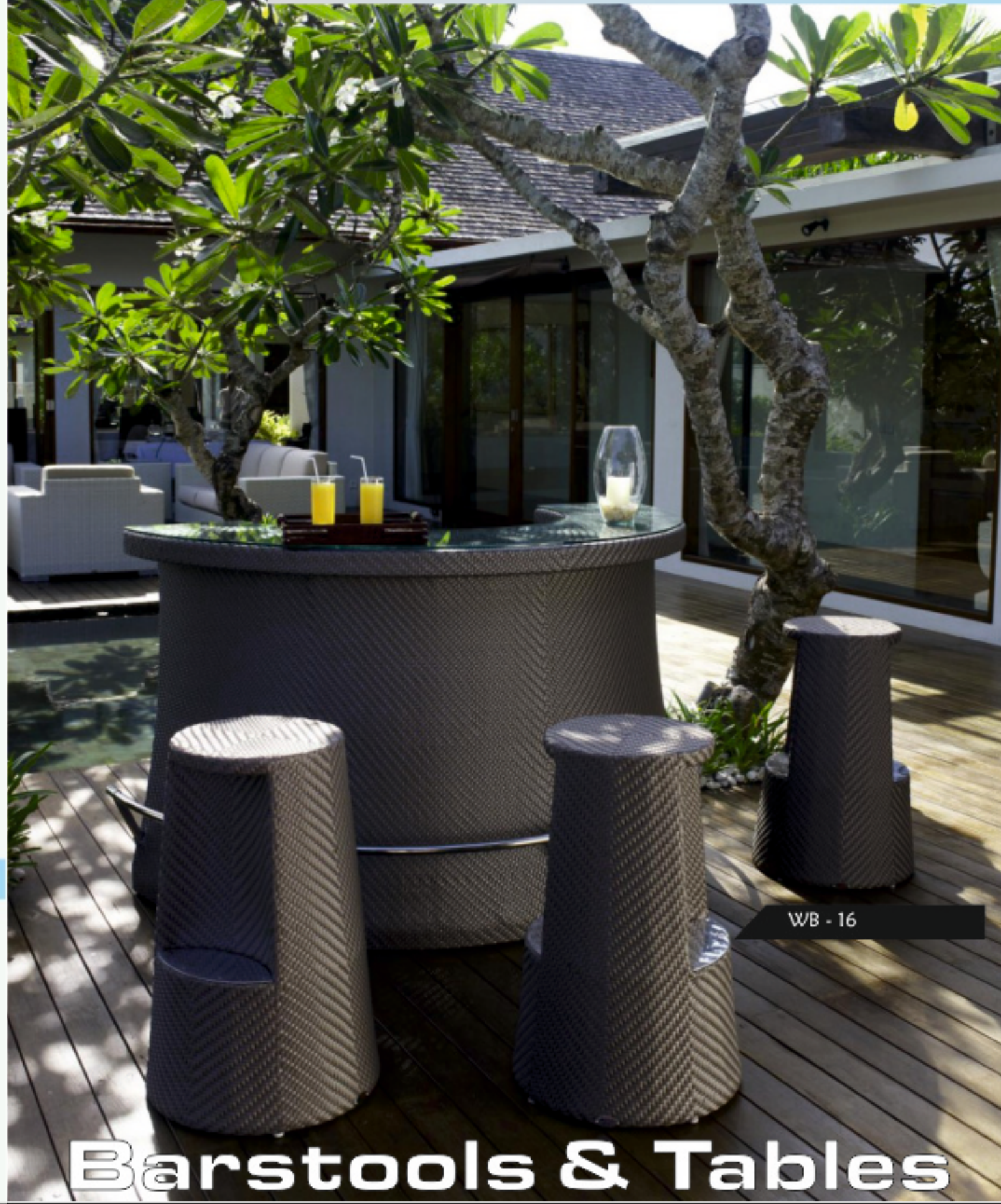
WB - 16