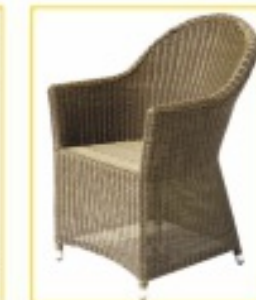
MPOC - 26