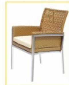
MPOC - 23